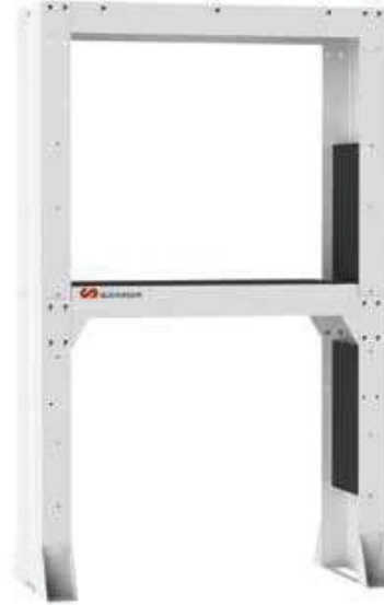
SIX HOSE REEL STAND

Very solid construction, allows mounting six RM-12 or RM-34 hose reels depending on models. Two extra reels can be mounted using the optional accessory. Six reel stands include perforated internal side panels and drip tray.