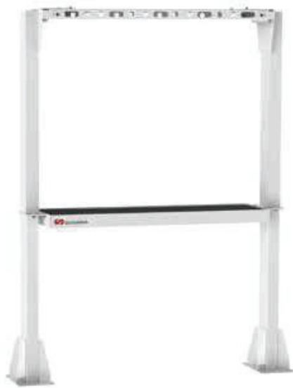
FIVE HOSE REEL STAND