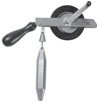
TAPES WITH FRAMES