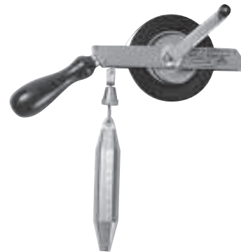
TAPES WITH FRAMES